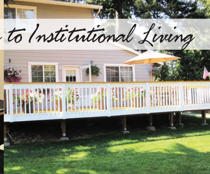
Beautiful Inside & Out