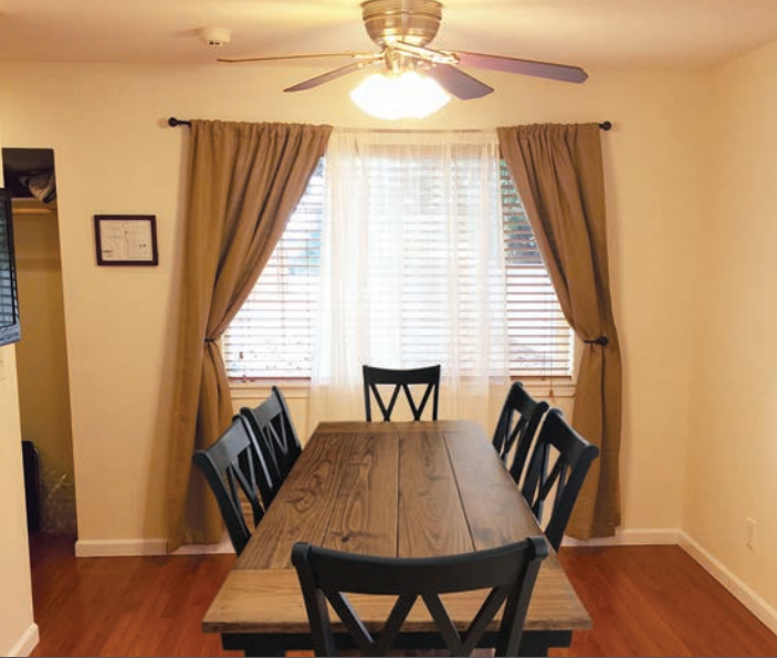
All the Comforts of Home