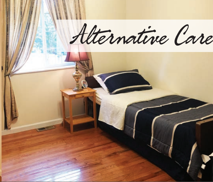
Large Private Rooms