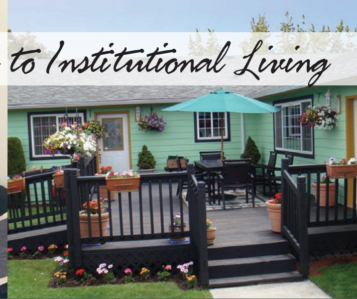
Beautiful Inside & Out