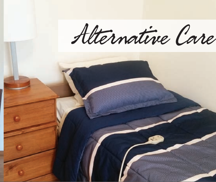
Large Private Rooms