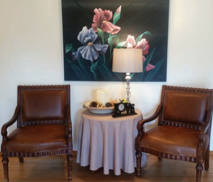
All the Comforts of Home